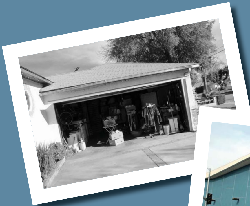
MEND beginnings June 1971

Looking back on our 39 years. As we look back on almost four decades of giving, healing and mending, we honor MEND's humble beginnings, celebrate how far we've come, and prepare for challenging days ahead as more and more people face the difficult financial situations that can lead to poverty. THE 2010 MEND ANNUAL REPORT