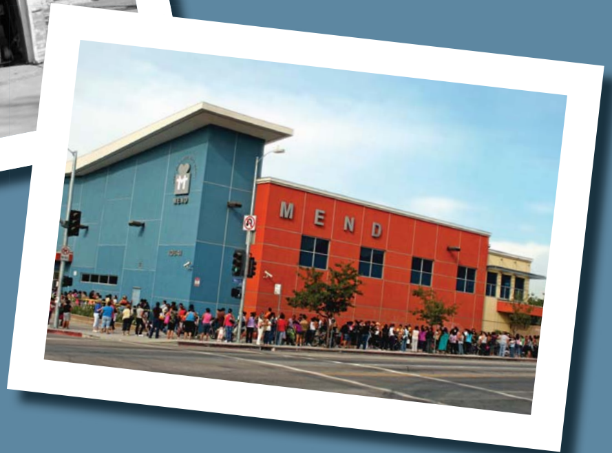
MEND January 2011